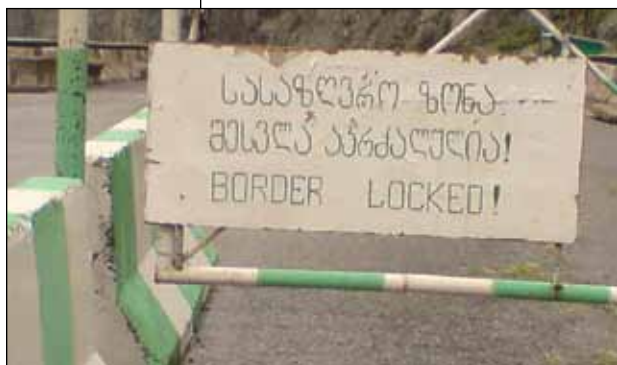
Above: Border fence between Russia and Georgia.