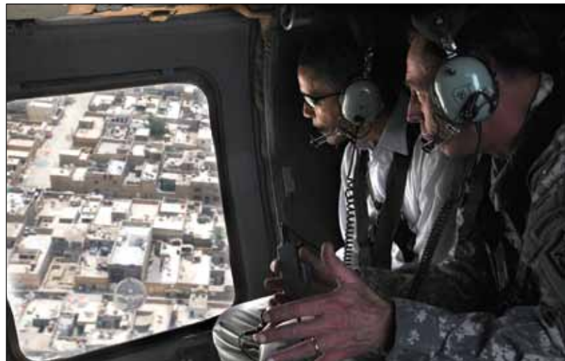
Above: Barack Obama with General David Petraeus in Iraq.

In his victory speech on November 4, 2008, President-elect Barack Obama appealed to our best selves, reminding us of an America acting from a sense of moral principle, an America that seeks to redress injustice at home and tyranny abroad. He called us to face our current crises from a shared sense of moral purpose. But I wonder whether he